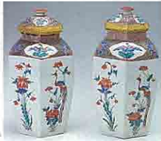
Hexagonal Jar with Overglaze Polychrome Enamel Design of Flower and Bird (Kakiemon style)