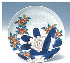
▲ Dish with underglaze cobalt-blue and Overglaze Polychrome Enamel Design of Rhododendron and Azalea(Nabeshima ware)