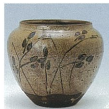
▲ Jar with Underglaze Iron-brown Design of Bush Clover (Egaratsu type)

In this room, the viewer is introduced to ancient ceramics produced at various kilns in Kyushu, such as Kogaratsu made in Hizen province, early Imari and other excellent porcelains produced in the Kakiemon style or at the Nabeshima clan kiln.