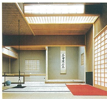
▲ Tea-ceremony Room

A private or group exhibition, or a small-scale special exhibition can be held in this room at any time.