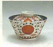
Lidded Bowl with Overglaze Polychrome Enamel Design of Jewel String and Red (1710 - 1750s)