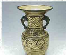
Sawankhalok-style Vase with Ears in Underglaze Cobalt-blue (Satsuma, Naeshirogawa ware)