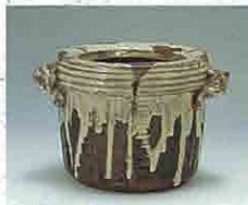
Water Jar with Ears with Straw-ash Glaze (Chikuzen, Takatori ware)