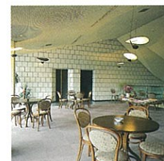
▲ Cafeteria (3F)