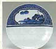
Dish with Underglaze Cobalt-blue Design of Landscape and Geometricized Circle Pattern. (1650 - 1670s)