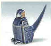
Bird-shaped Incense Container, Cobalt-blue Glaze (1630 - 1640s)