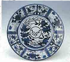
Kraak-style Large Dish with Underglaze Cobalt-blue Design of Phoenix (VOC mark)