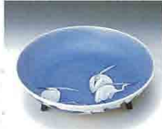
Tripod Dish with Underglaze Cobalt-blue Design of Heron (Nabeshima ware) Important cultural property