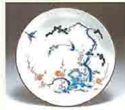
Lobed Dish with Overglaze Polychrome Enamel Design Characterized by the Pine, Bamboo, Plum, and Bird (1670 - 1690s)