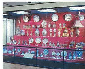
▲ Kanbara Collection (deposited by Arita-machi)

This is the room in which the viewer can obtain knowledge of Kyushu ceramics. The history and characteristics of ceramics are shown in detail. The export Imari porcelains exhibited at the Kanbara Collection especially attract public attention.