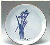
Dish with Underglaze Cobalt-blue Design of Iris (1670 - 1690s)