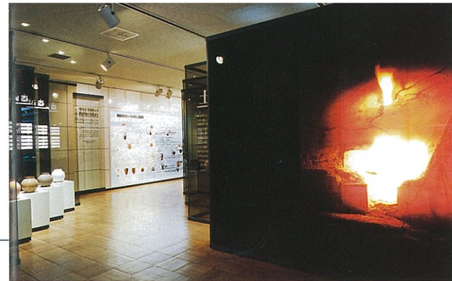
▲ History of Kyushu Ceramics (Exhibit Room No.4)