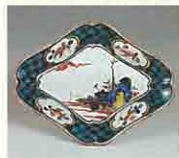
Rhombic Dish with Overglaze Polychrome Enamel Design of Boat Fishing (1650 - 1680s)