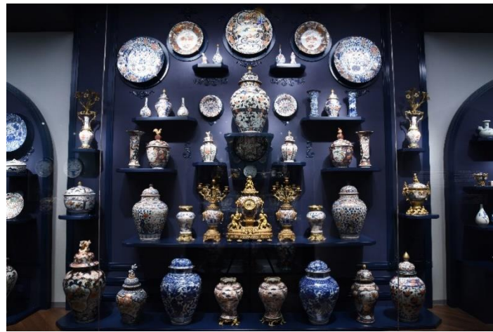
Part of Kanbara Collection (owned by Arita Town)