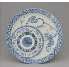
Lobed Large Dish with Japanese Zodiac Design in Underglaze Cobalt Blue Hizen, Arita, 1820s – 1860s