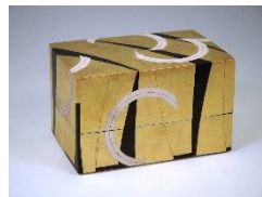
Box with Geometric Pattern Design in Overglaze Gold and Black glaze Ishihara Shōji, 2009

This room introduces various works created by ceramic artists who represent each prefecture in Kyushu area. With a total of about 100 pieces, it extensively covers from the tea ceremony ware to avantgarde works. The viewer can enjoy diverse production techniques and artistic presentations through the works.