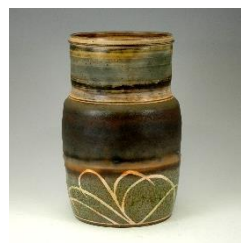
Bottle with Paddled and Inlaid, Brushed White Slip, Karatsu ware, "Sawa", marsh Nakazato Hōan, 1987 Exhibited The 19 th Nitten, Japan Art Exhibition

Works created by representative ceramists in Saga prefecture, including members of the Japan Art Academy and preservers of intangible cultural property (Living National Treasure) are displayed.