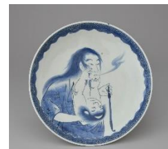
Large Dish with Yamanba (Mountain Witch) and Kintarō Design in Underglaze Cobalt Blue, Hizen, Arita, 1820s – 1860s