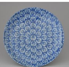
Large Dish with Circled Crane Design in Underglaze Cobalt Blue Hizen, Arita, 1820s – 1860s