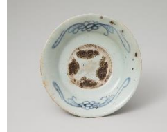
Small Dish with Scrolling Flower Design in Underglaze Cobalt Blue Hizen, Arita 1610s -1630s Shibasawa Collection

This room introduces masterpieces of Arita ware with visual images and spatial design. The viewer can enjoy a diverse range of stories behind Arita ware while exploring rooms featuring themes such as history and culture.