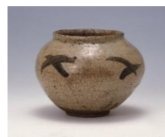
Jar with Underglaze Iron-Brown, Egaratsu Type, Stoneware Hizen, 1580s- 1610s