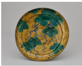
Large Dish with Ivy Design in Overglaze Polychrome Enamels Hizen, Arita 1655 -1660s

First time exhibition of 43 objects from the Shakugikō Collection donated in the fiscal year of 2023. We introduce excellent works from the Hizen porcelains, mainly produced in the 17th century, including early Imari, early Iro-e , and early Nabeshima.