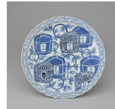
Lobed Large Dish with Scattered Sake Barrel Design in Underglaze Cobalt Blue Hizen, Arita, 1820s – 1860s