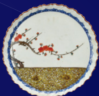
Lobed Dish with Plum, Peony, and Scrolling Vine Design in Overglaze Polychrome Enamels, 1650–1660s

A series of innovations led to Japan's first overglaze polychrome enamel porcelain, whose high level of quality approached that of Chinese porcelain.