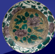
Large Dish with Bird and Peony Design in Overglaze Polychrome Enamels, circa 1650s