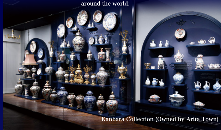
Kanbara Collection (Owned by Arita Town)

As a result of the civil war accompanying the transition from the Ming dynasty to the Qing dynasty in China, the volume of Chinese porcelain exports declined precipitously, and in its place Arita ware began circulating around the world.