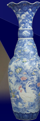
Large Flower Vase with Rooster and Flower Design in Underglaze Polychrome Colours, 1875–1880s

Exports of Arita ware resumed in earnest on the eve of the opening of Japan's ports during the Bakumatsu period. New types of Arita ware spurred on modern developments to the form.