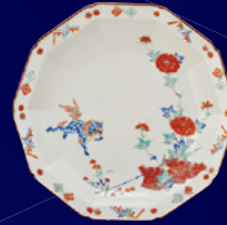
Decagonal Dish with Chinese Lion and Peony Design in Overglaze Polychrome Enamels, 1670–1690s

During the second half of the 17th century, the two great styles of Japanese porcelain, Kakiemon and Nabeshima, were perfected.