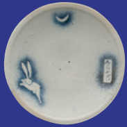
Dish with Hare, Moon, and Blown Ink Design in Underglaze Cobalt Blue, 1630–1640s