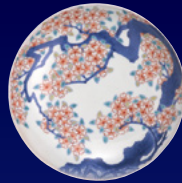
Dish with Cherry Tree Design in Overglaze Polychrome Enamels, 1700–1720s