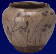
Jar with Bush Clover Design in Underglaze Iron Brown, 1590–1610s

Old ceramics from all over Kyushu and Okinawa, including Karatsu ware, Shoki Imari (Early Imari) and other excellent porcelain in the Kakiemon style or Nabeshima style are on display.